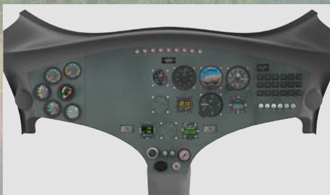
a panel for individual GPS installation,