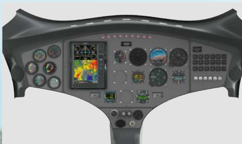
"State of the art" GPS displays (e.g. Garmin 695),

Luxurious overview, luxurious design, luxurious equipment: The Cavalon cockpit can be equipped individually with different options: