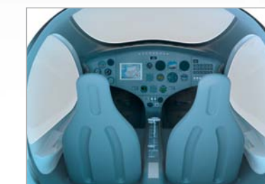
A new dimension: the Cavalon offers a huge interior.