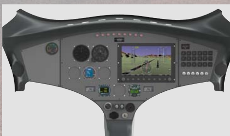
or even up to installed high-end EFIS solutions.